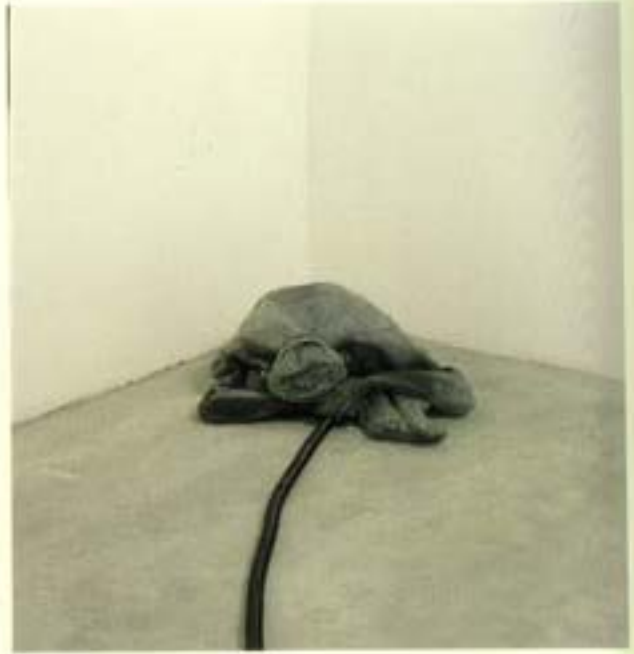
■ EL IMPERDURABLEMENTE PRESENTE, 2002, Inflated latex sculpture.