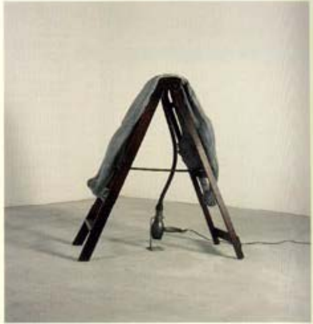
■ EL PENDULO HUMANO , 2002, inflated latex sculpture.