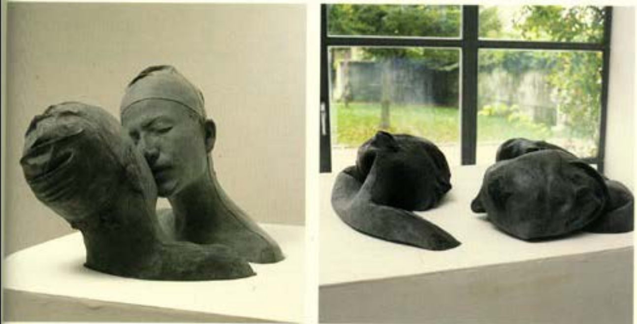
PALABRAS INTERACTIVAS , 2002, Inflated latex sculpture on a wooden plinth.